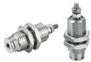
CJPB 10 x 15