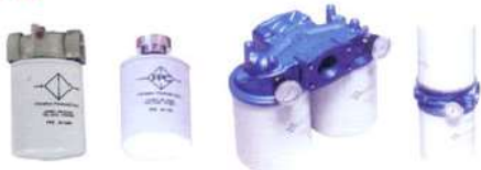
06P, 08P 06t, 08T 12PR 12P:series